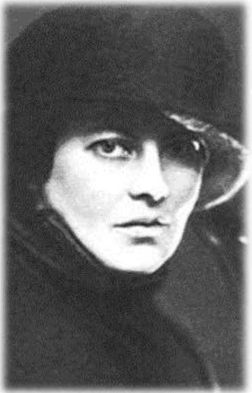
Figure 3 Margaret Storm Jameson